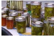
Street-Food Pickle Maker Dips Into Family Tradition