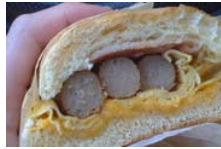
Irish Brunch: The Outer Richmond's Belfast Bap is a Lifestyle