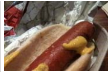
Not So Haute: Ballpark Dogs Remain Lovably Meh